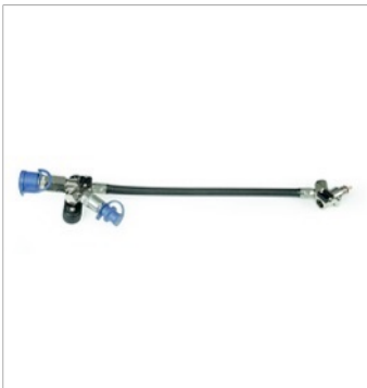
Airline Belt manifold with ASV